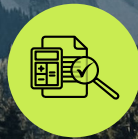
Audit and accounts